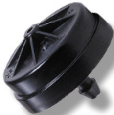
PRESSURE COMPENSATING (PC)

MAINTAINS A UNIFORM FLOW RATE WITH THE WIDEST COMPENSATION RANGE - 7 TO 45 psi