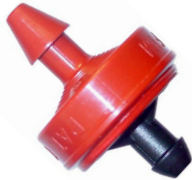
WOODPECKER PRESSURE COMPENSATING JUNIOR (WPCJ)