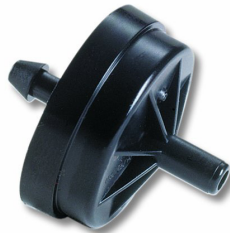
WOODPECKER PRESSURE COMPENSATING (WPC)