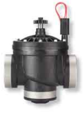
The top-of-theline valve you can count on for superior durability and ability to handle exceptionally high pressures