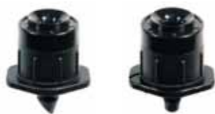
Spectrum™ Barb 4 mm