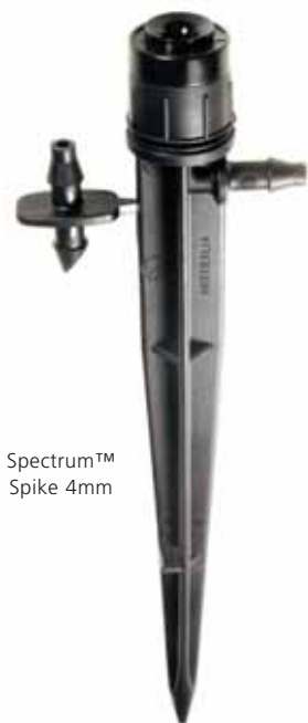
Spectrum™ Spike 4mm