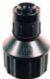
Spectrum™ Thread 1/2"