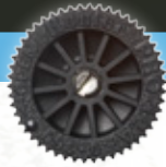
PRO ADJUSTABLE NOZZLES