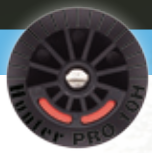
PRO-SPRAY FIXED ARC NOZZLES