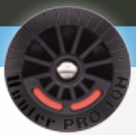
PRO-SPRAY FIXED ARC NOZZLES