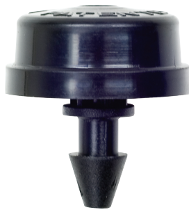
BUTTON DRIPPER (BD)

ADAPTABLE TO MANY APPLICATIONS - POSITION THE DRIPPER EXACTLY WHERE IT'S NEEDED