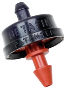
WOODPECKER DRIPPER (WP)